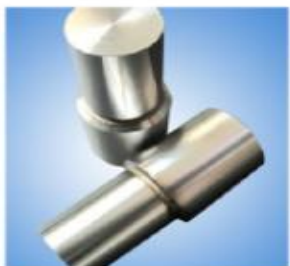
Medical equipment Welding