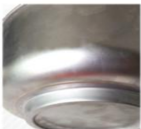
Stainless steel product welding