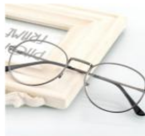
glasses and watch welding