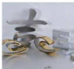
Advertising word welding